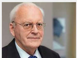
Prof. Dr. Roman Herzog †