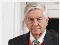
Prof. Frits Bolkestein