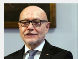
Prof. Dr. Dr. Udo Di Fabio