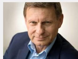
Prof. Dr. Leszek Balcerowicz